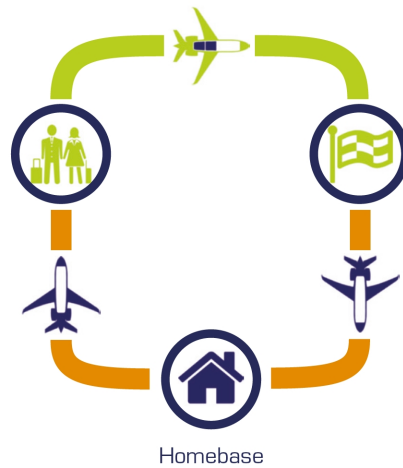
Figure 2: Scheme of classic empty flights (empty legs, depicted in orange)