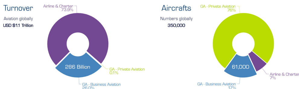
Figure 1: Total market of aviation

Global revenue growth in commercial aviation between 2003 and 2017 on average amounts to around 10% per year, well above the average in Asia. (Statista, 2018b)